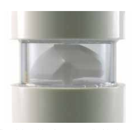
The triple turbine (patent pending) in the new inline mixer model induces the turbulence needed for increased mixing performance with a decreased differential pressure. This triple turbine changes the directional flow of the fluids, allowing mixture prior to exiting the mixing chamber.